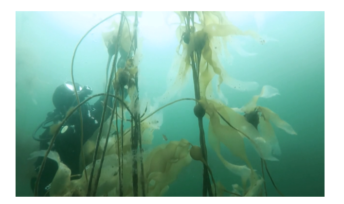
Figure 1. SCUBA Diver measuring bull kelp at Dodd Narrows site (MABRRI, 2019).

Over the course of the study, four of the six kelp measured at the enhancement plot off of the Winchelsea Islands were present up to day 76 (5th site visit) and grew an average of 0.7 cm/day, reaching a maximum average height of 99.8 cm. The remaining two kelp that were measured were only present up to day 55 (4th site visit) and grew an average of 0.7 cm/day, reaching a maximum average height of 86 cm. By the sixth survey, no kelp were observed on this line at this site.